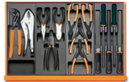
T153 T138 T145 T236