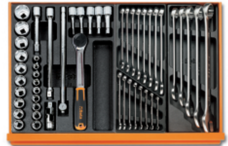
T80 T05 T06