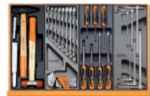
T234 T33 T208 T68