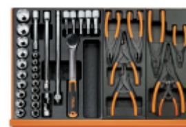
T80 T145 T146