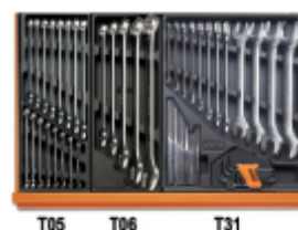
T05 T06 T31