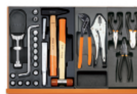
T264 T234 T153 T138