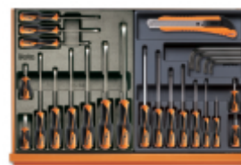
T167 T168 +96N +1771