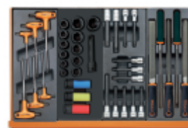
T55 T111 T113 T236