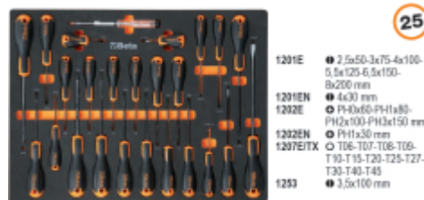
1201E 2,5x50-3x75-4x100-5,5x125-6,5x150-8x200 mm 1201EN 4x30 mm 1202E PH0x60-PH1x80-PH2x100-PH3x150 mm 1202EN PH1x30 mm 1207E/TX T06-T07-T08-T09-T10-T15-T20-T25-T27-T30-T40-T45 1253 3,5x100 mm