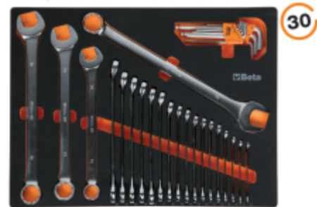
42C 6-7-8-9-10-11-12-13-14-15-16-17-18-19-20-21-22-24-27-30-32 mm 96BPC/SK9 1,5-2-2,5-3-4-5-6-8-10 mm