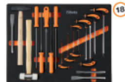
895/1 1/4" - 1/4" 895/3 1/4" - 3/8" 895/6 5/16" - 1/2" 1370C 300 g 1390C Ø 35 mm 34C 150-175-200 mm 1719C Q ● 200 mm 1719C T ▲ 200 mm 1719C P ▮ 200 mm 1719C M ▸ 200 mm 1719C R ● 200 mm