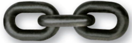
WLL Ton UNI EN 818